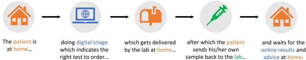
Figure 1. Simplified representation of the diagnostic process, the traditional vs the digital. Traditional digital diagnostics (a) requires patients to physically visit their physician and the diagnostic laboratory premises and go back home to wait for the results and instructions for follow-up when necessary. In the case of digital diagnostics (b), patients are provided with the right online tools to determine if a test is necessary. When necessary, a request is placed online, the sample can be taken at home and sent to the lab, and the results can be received at home, for example, through a patient portal. (a) Traditional diagnostic process. (b) Digital diagnostic process.

laboratory tests [3]. Additionally, avoiding unnecessary travelling contributes to ecologic sustainability [7].